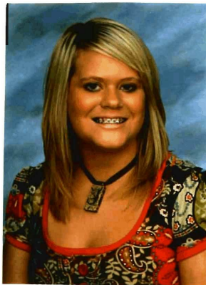
3 rd Vice-President