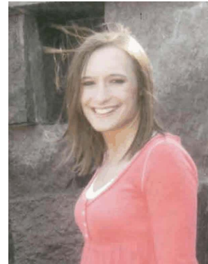
2 nd Vice-President