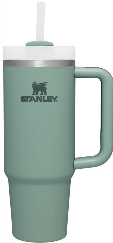
Stanley The Quencher H2.0 FlowState 30 oz