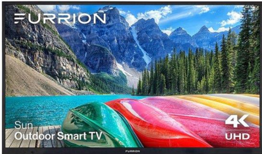
Furion 55" Aurora Sun Smart Full Sun 4K LED TV